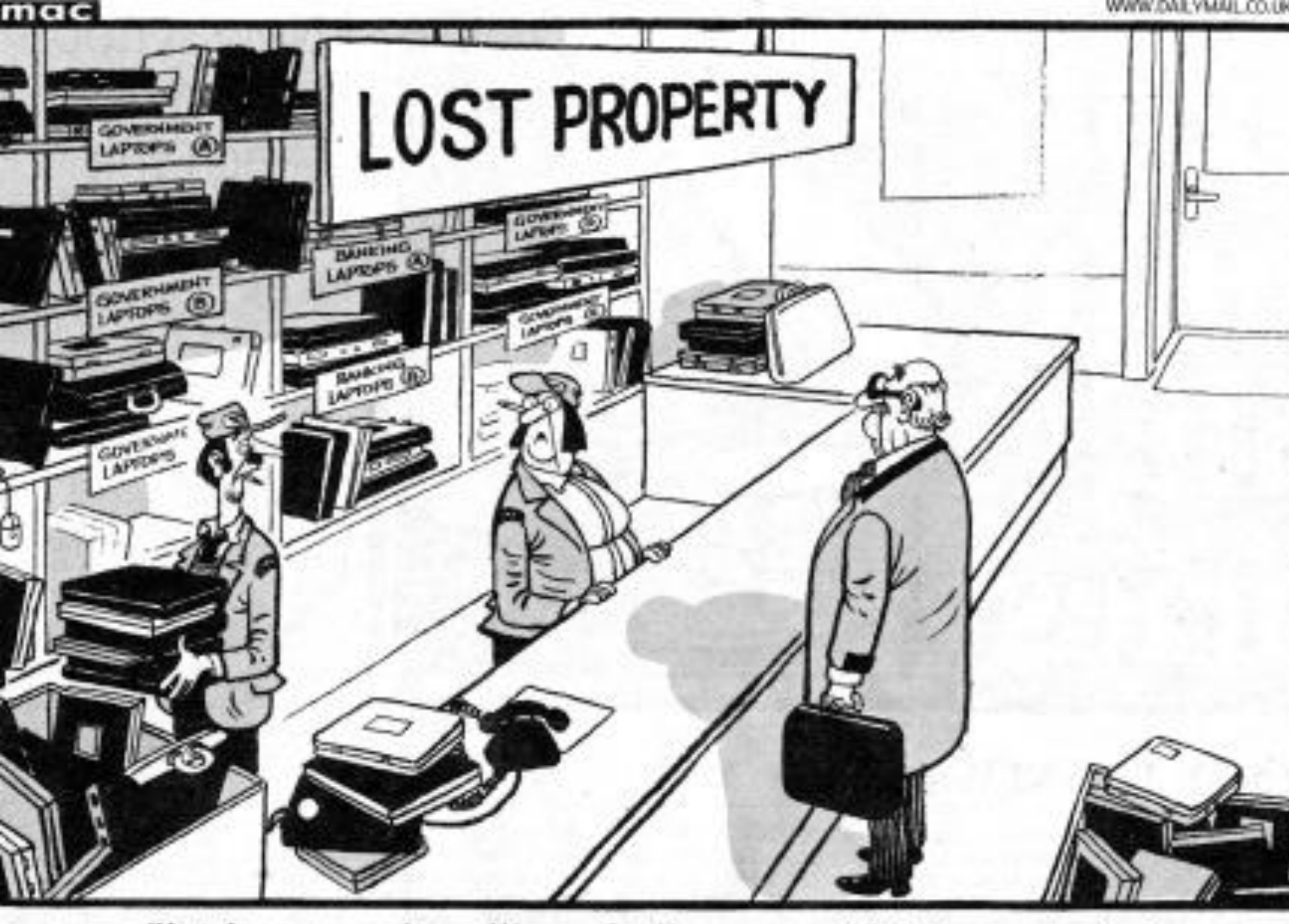
'Here's an unusual one, Wayne: Gentleman says he's lost an umbrella.'