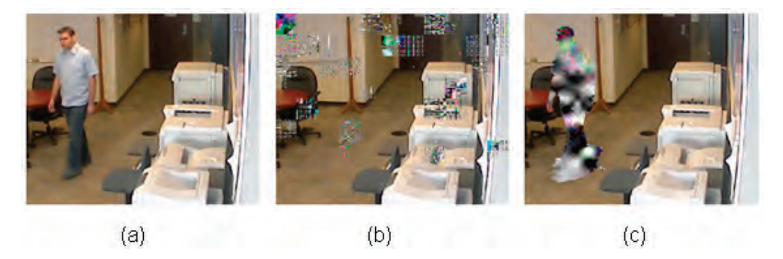
Figure (a): original content stream; Figure (b): both shape and texture have been encrypted and despite attempts to hack into this with an incorrect key, the objects of interest could not be decrypted; Figure (c): example where only the texture of the whole body (or only a face for example) is encrypted.

Nevertheless, the Commissioner has said it is incumbent upon those who wish to deploy surveillance systems to be aware of and adopt privacy-enhancing technologies whenever possible, especially as they become commercially available. The TTC report describes research that has shown that it is possible to design surveillance systems in a manner that may successfully address issues of public safety while, at the same time, protecting the privacy of law-abiding citizens. As an example of the research being conducted into privacy-enhancing technologies, the Commissioner cited the work of researchers Karl Martin and Kostas Plataniotis at the University of Toronto, who used cryptographic techniques to develop a secure object-based coding approach.<sup>18</sup>